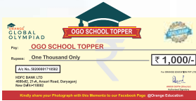
SCHOOL TOPPER MEMENTO